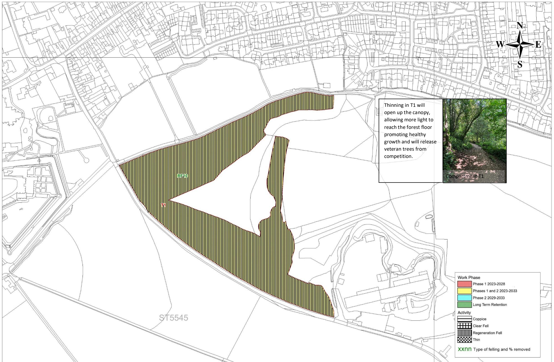
Somerset Sites Woodland Plan - 2023-2043 Tor Hill- Map 2 Activity - Phases 1 and 2 Scale 1:2500 at A3